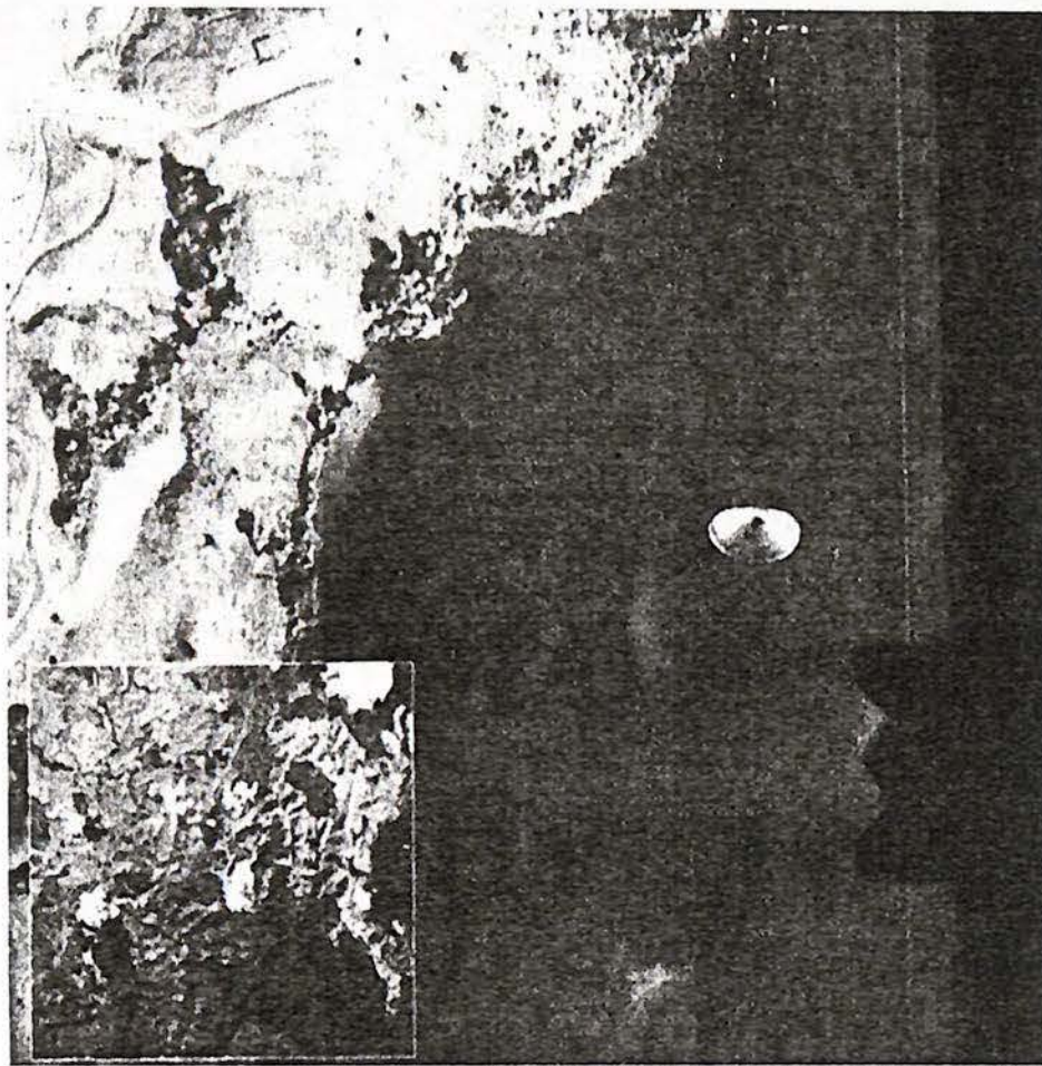
Images of purported UFOs, taken by, above, a Costa Rican mapping aircraft in 1971 and reproduced on the cover of a report by the French military; below left, a Zanesville, Ohio, barber in 1966; below right, a high school student in Beaver, Pa.; bottom right, teenage brothers in Detroit in 1967.

Air Force Regulation 200-2, "Unidentified Flying Objects Reporting," for ex-